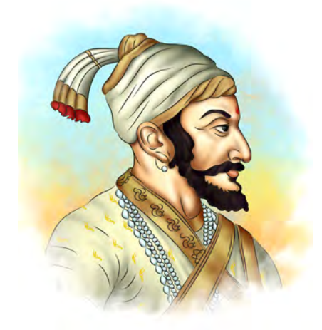
Chhatrapati Shivaji Maharaj

*The northern region of Goa was known as 'Bardesh'.