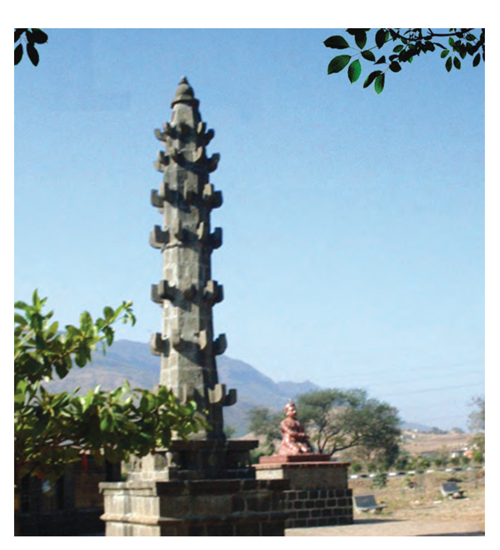
The Memorial of the First Anglo-Maratha war - Vadgaon Mawal